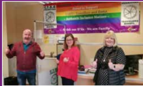
Clondalkin Travellers Development Group

An Roinn Dlí agus Cúirt Department of Justice and Equality